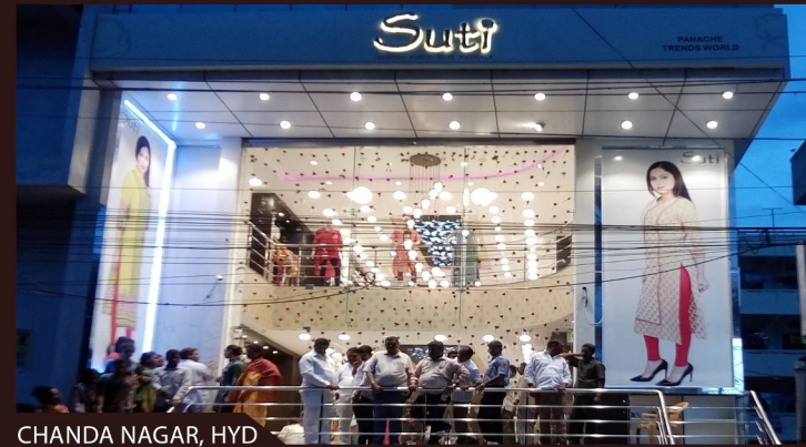
CHANDA NAGAR, HYD