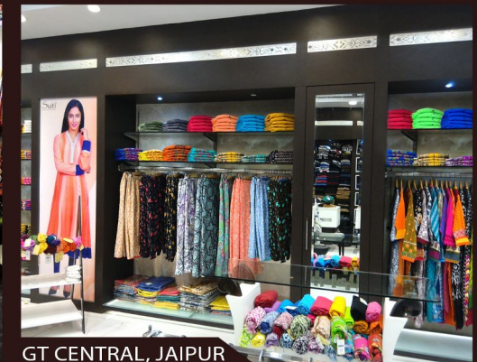
GT CENTRAL, JAIPUR