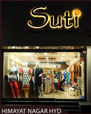
HIMAYAT NAGAR HYD