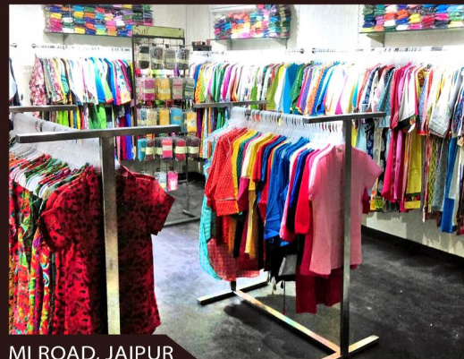
MI ROAD, JAIPUR